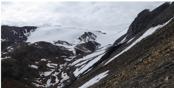
Descending northwest from Yakawa Kang Pass. Belgian Peak is the summit at far left and was climbed via the snow slopes just this side of the skyline ridge.