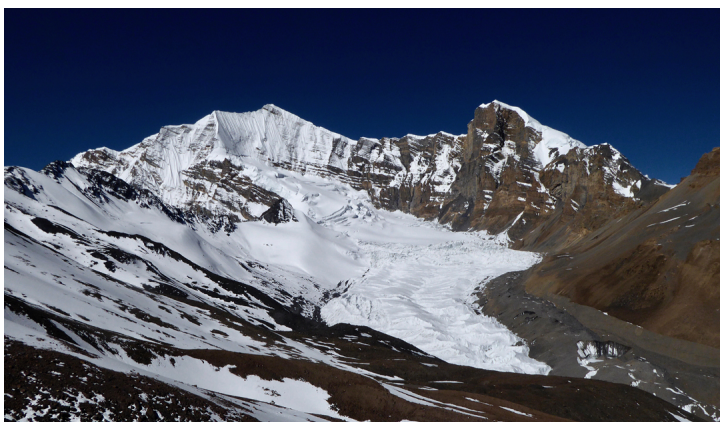
Purbung Himal ( 28^{\circ}48'4.71''\text{N} , 84^{\circ}1'4.74''\text{E} , 6,500m), seen from the north-northeast after crossing the Teri La.