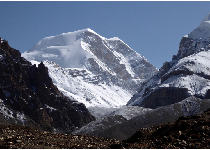
Khumjungar Himal (a.k.a. Khamjung, 6,759m), one of the highest peaks of the Damodar, seen to the north from the approach up the Labse Khola towards the Teri La. This south-facing aspect of the mountain has not been attempted.