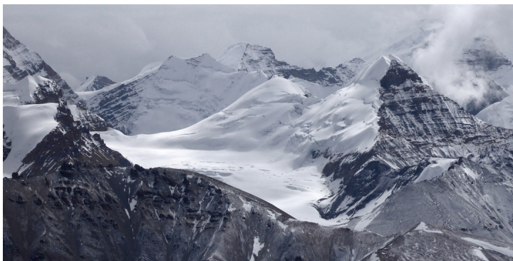
Looking northeast at unclimbed summits of the Teri Himal from the top of Purkung.