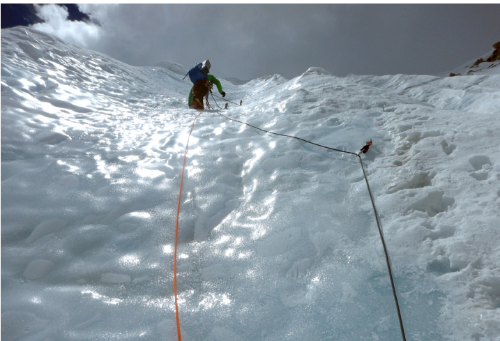
Glassy ice near the top of the north face of Peak 6,010m. In this area, the climbers could manage pitches of only 10m to 15m because of the iron-hard ice.