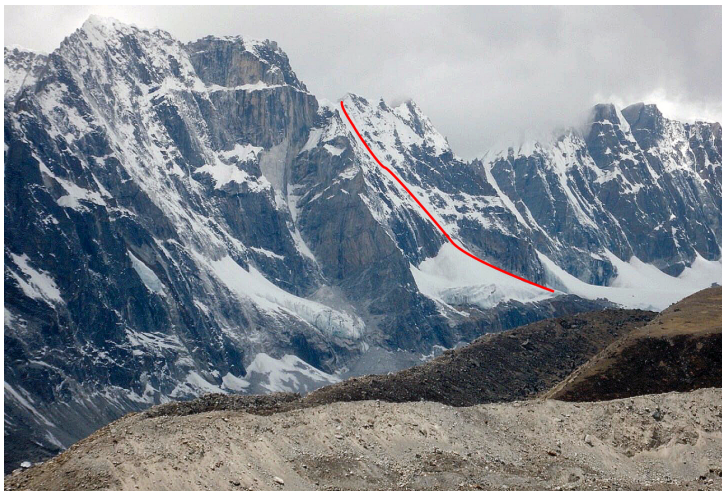
The north side of Lobuche West and the line of the 2017 Spanish Route on Peak 6,010m to about 10m below the summit.