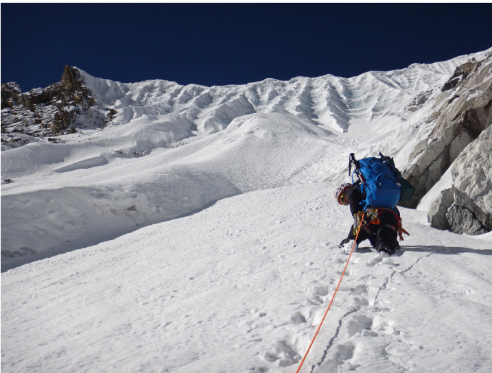
Heading toward the fluted section of the north face of Peak 6,010m.