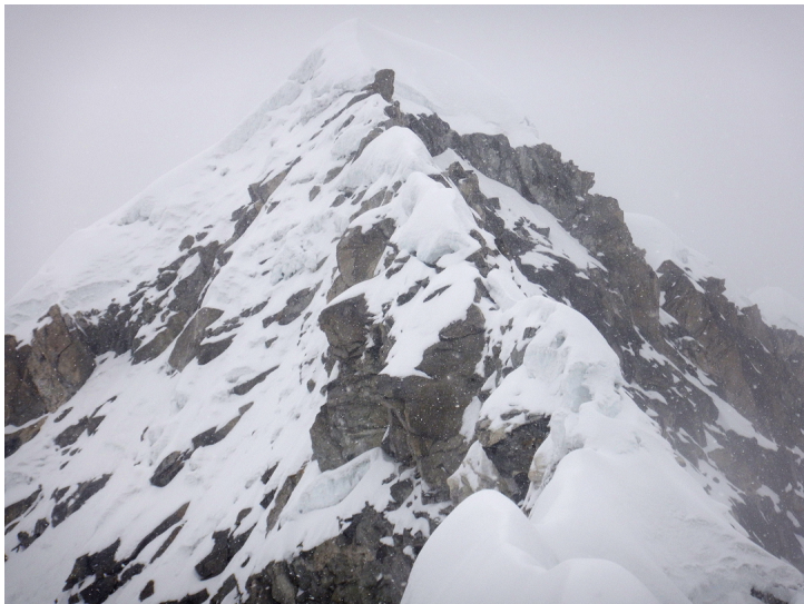
The summit ridge of Peak 6,010m, where Angel Salamanca fell into a concealed crevasse.