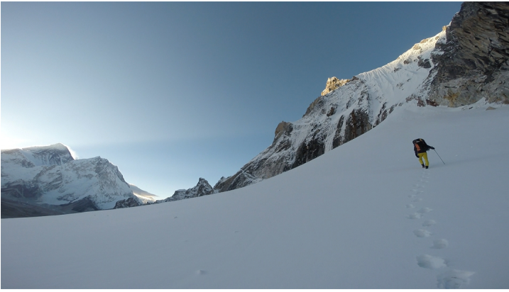
Approaching the north face of Peak 6,010m, with Everest and Nuptse at far left.