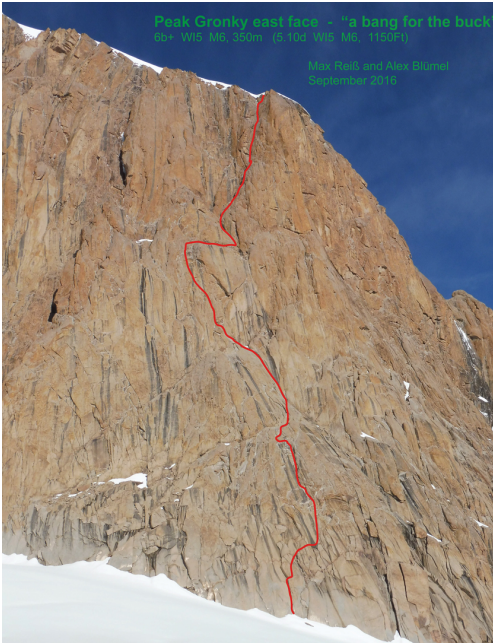
A Bang for the Buck (350m, 6b+ WI5 M6) on the east face of Pik Gronky.