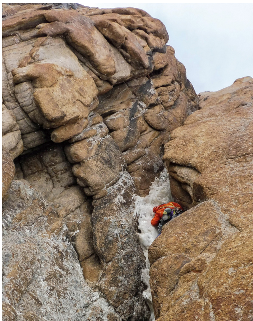
The last mixed pitch on A Bang for the Buck, east face of Pik Gronky.