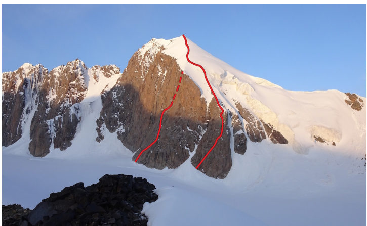
Pik Gronky showing (1) Bang for the Buck (350m, 6b+ WI5 M6) and (2) the East Buttress (800m, UIAA IV+ M5 75°). Left of this peak lie Pik Carnovsky and the Ochre Walls (ca 4,800m).