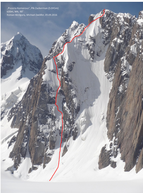
Pizzeria Komarovan (600m, M4 90°) on Pik Zuckerman. The pointed summit on the left is Pik Unmarked Soldier (5,352m).