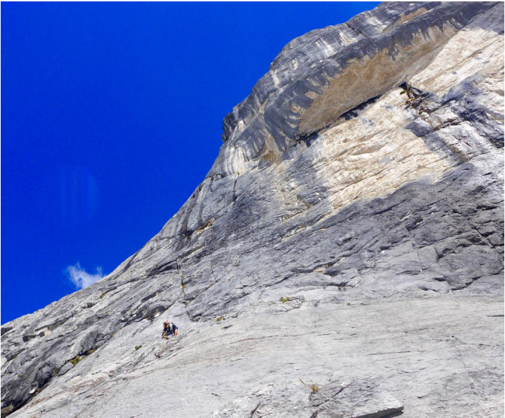
Max Bonniot starting up the first pitches at 4,900m.