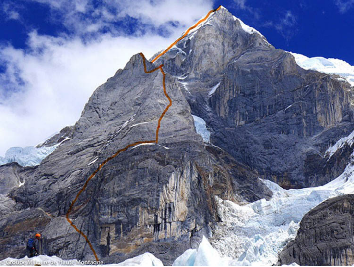
Le Bruit des Glaçons, the new route up the east face and southeast ridge of Siula Grande (6,344m).