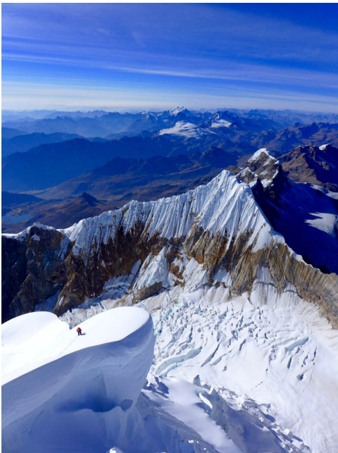
Didier Jourdain nearing the top of the southeast ridge, on the verge of reaching the summit of Siula Grande.