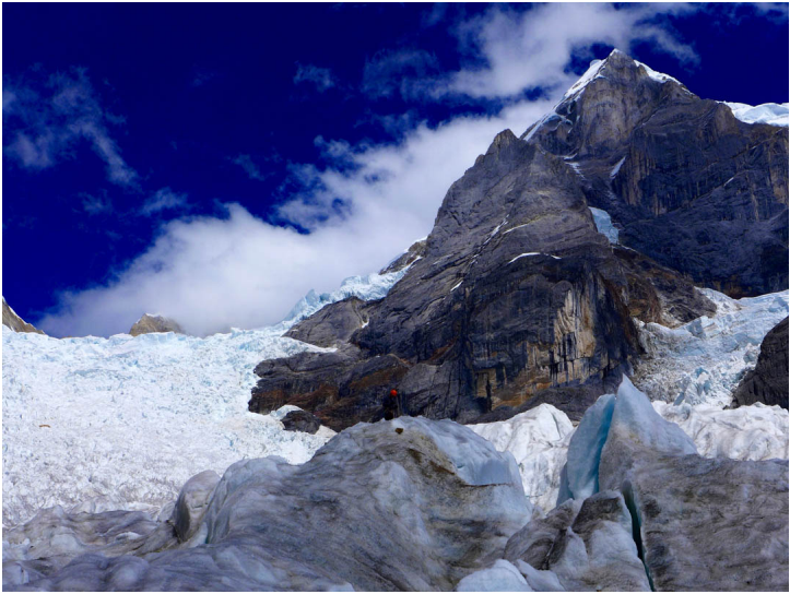
During the August 16 reconnaissance of Siula Grande, around 4,600m.