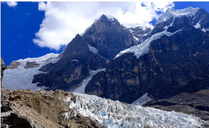
The east face of Siula Grande (6,344m), seen from 4,500m during the approach.