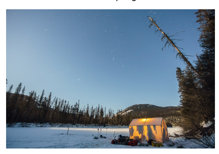
Base camp on the frozen Nipissis River.