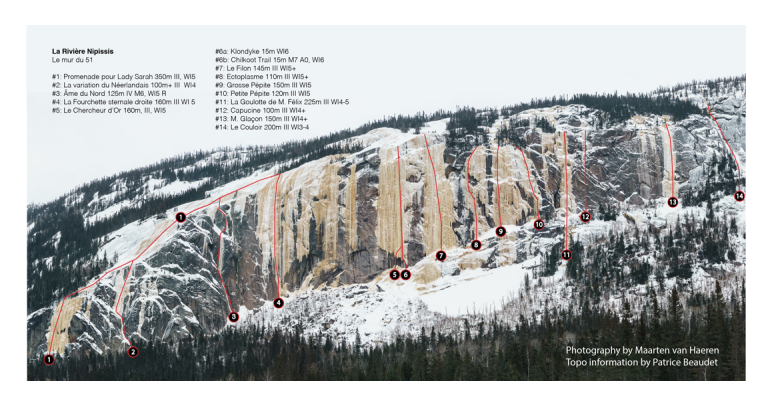
Photo-topo showing known routes at Le Mur du 51 at Rivière Nipissis as of November 2016