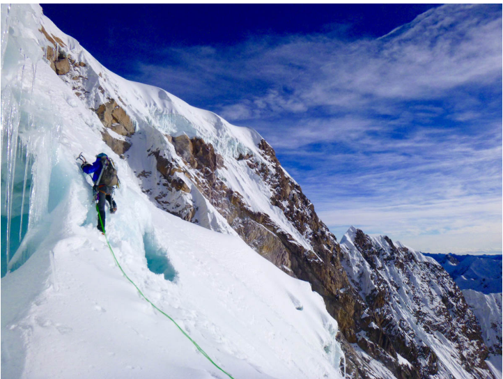
Nathan Heald leading one of the upper pitches on the east face of Jatunhuma.