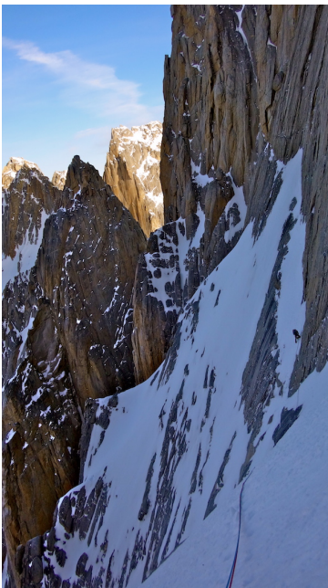
Traversing across steep snow slopes on the upper half of the west face of the Citadel.