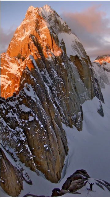
Sunset on Kichatna Spire (8,985') from the bivy halfway up the west face of the Citadel.