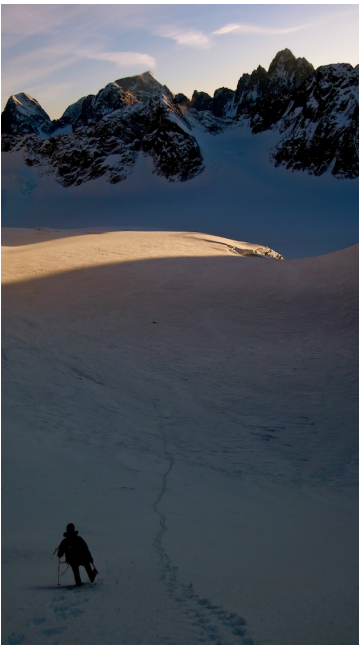
Descending to base camp after completing the first ascent of Westman's World.