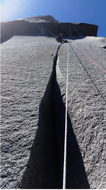
Steep and clean cracks on Iron Skirt.