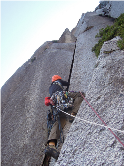
Steep and clean cracks on Iron Skirt.