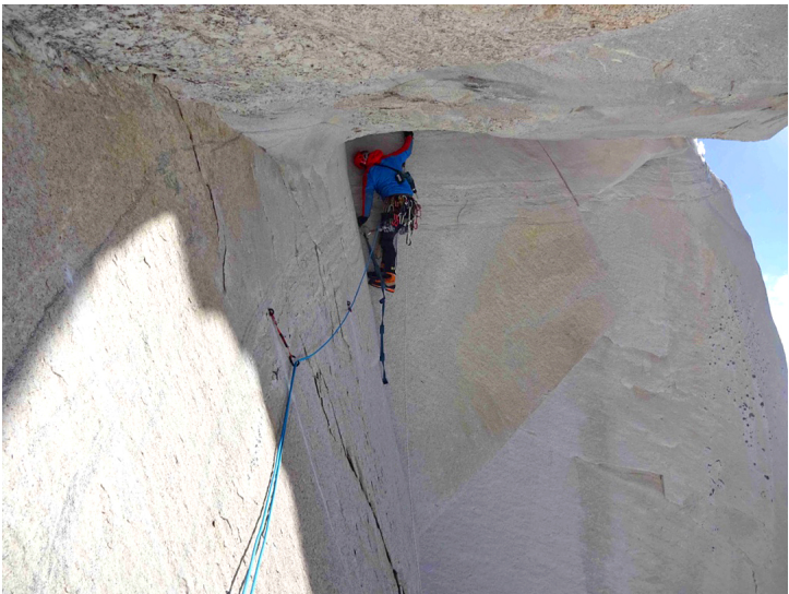
Txus Lizarraga on the big roof (A2+) four pitches above Camp 2 at 6,040m.