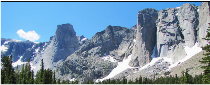
Formations of the Monolith/Dog Tooth area from the northeast. The Monolith is the obvious formation left of center. Lady and the Tramps climbs the south face (opposite) of the ridge that angles up right from below the Monolith. The very steep formation is Dogtooth Pinnacle. The formation with the prominent right-facing dihedral that beings at the bottom and ends at an equally prominent roof 200' up is the Wisdom Tooth. (A slab peeled off here after the first ascent.) The A-Frame Buttress is at the very right edge of the photo.