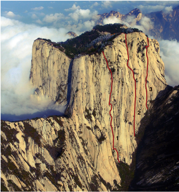
The south face of Hua Shan South Peak. (1) High Tide or Low Tide (2015). (2) Never Give Up (2014). (3) Climb Like You Are Dying (2015).