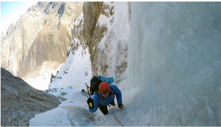
The ice gully alongside the serac barrier on Dechok Direct.