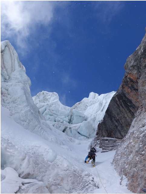
The narrow gully through the seracs on the first ascent of Dechok Direct.