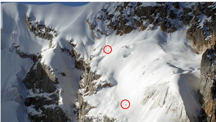
Approaching the main summit of Dechok Phodrang during the first ascent of Dechok Direct.