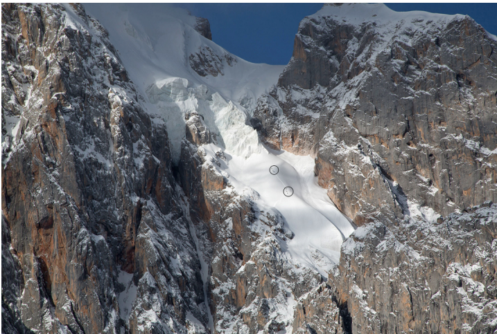
Six climbers, in two groups of three, approach the serac barrier during the first ascent of Dechok Direct. The route above took the hidden gully alongside the rock wall on the right. The north summit is above and to the right.