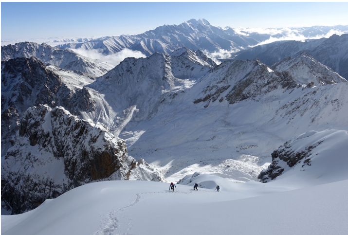
On the final ascent to the north summit of Dechok Phodrang. In the distance are the two summits of Kawarani (5,992m and 5,928m) in the Gongkala Shan, the higher climbed in 2014 (AAJ 2015).