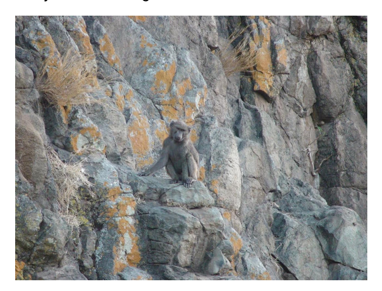
An onlooker on Molalit Tower.