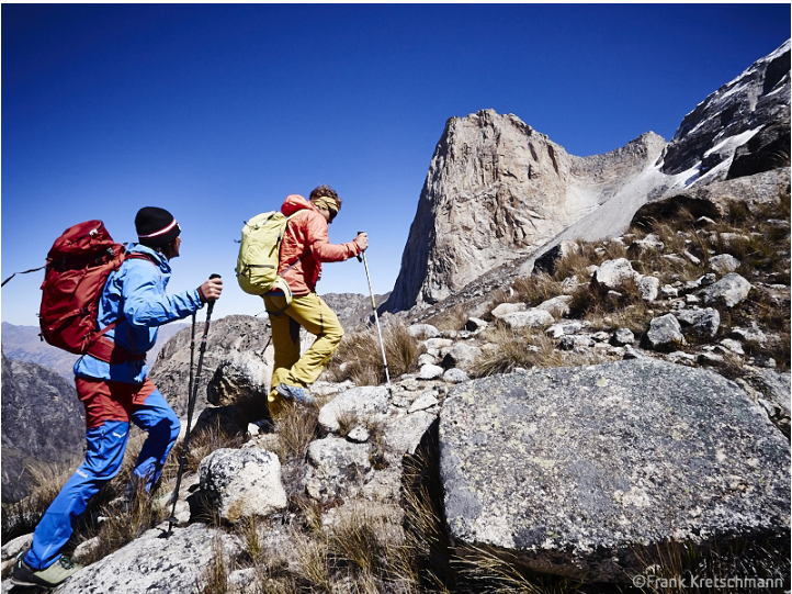
Approaching La Esfinge.