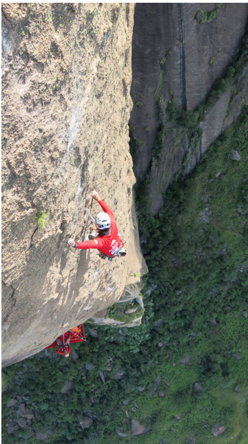
Climbing pitch eight.