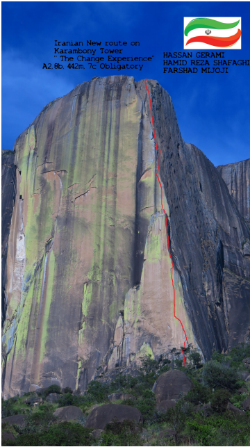
The Change Experience (440m, 8b A2, 7c obligatory) on Karambony Tower.