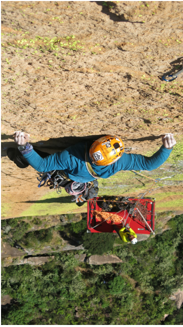
Bearing down on the pitch four crux (8b).