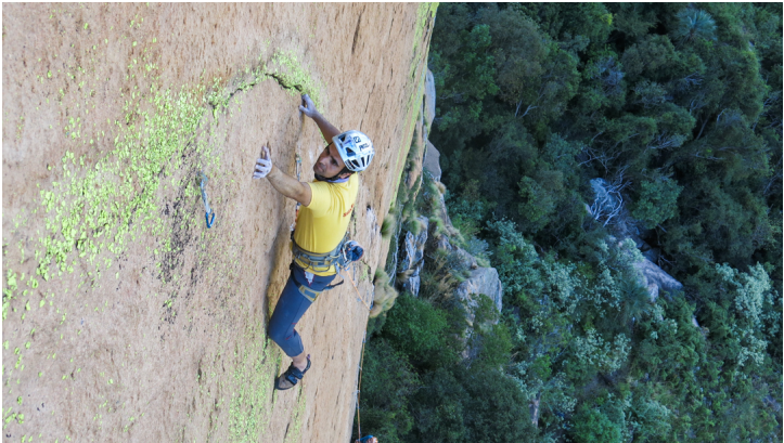
At work on pitch two.