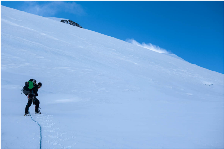
Gabe Messercola approaching the summit of Mt. Silverthorne.