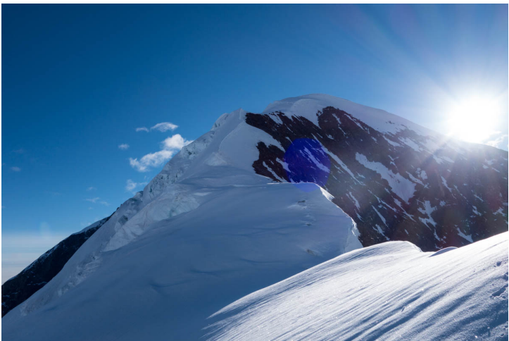
East Pyramid's southwest ridge from the col below.