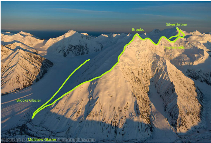
An overview of the traverse from Mt. Silverthron, across the Pyramid peaks, and over Mt. Brooks.