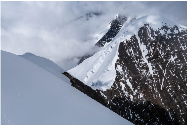
East Pyramid's southwest ridge. This ridge proved to be the crux of the route and was previously unclimbed.