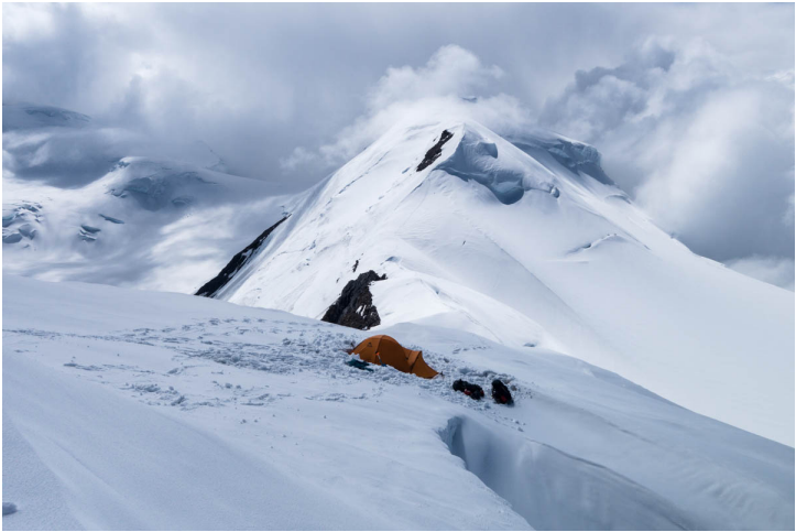
Camp on top of Central Pyramid.