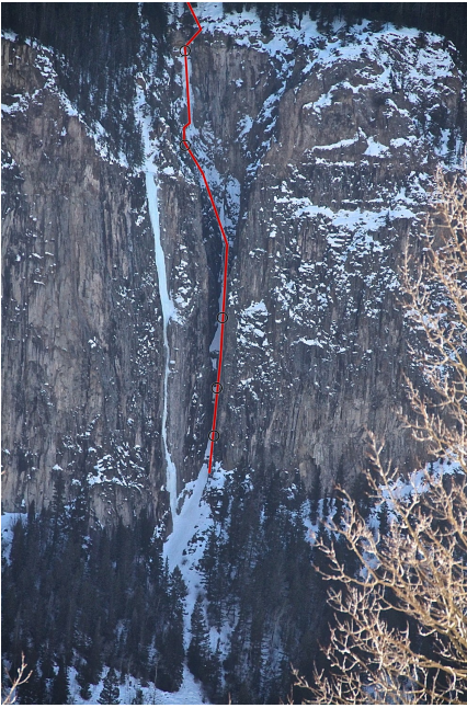
Photo topo of Belly of the Beast, with Ames Ice Hose located just left.