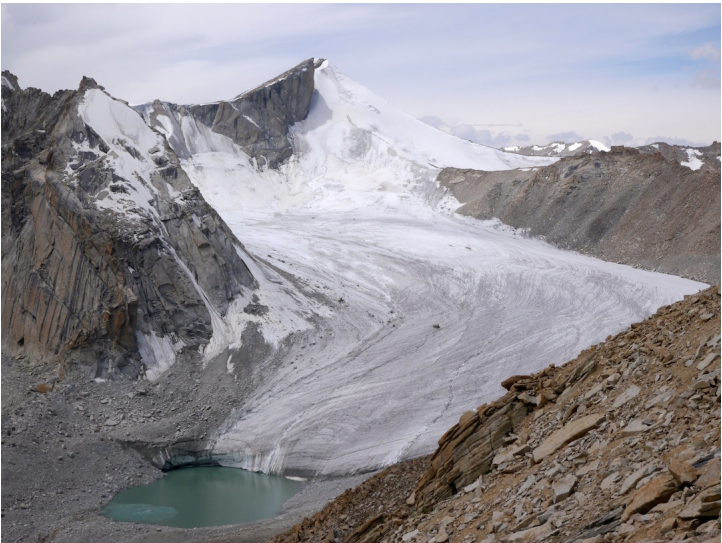
The head of Valley 1. The elegant pyramid is thought to be unclimbed.