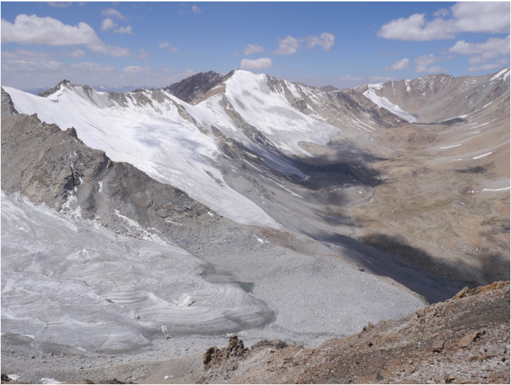
Unclimbed peaks in Valley 2, seen from the summit of Peak 5,600m.