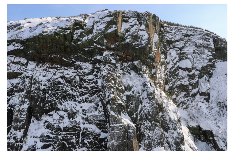
Louis Rousseau and Yannick Girard near the top of Sens Unique on the second day.