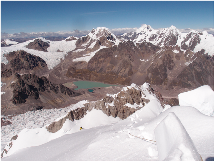
Climbing through deep snow up the final snow ramp to the summit.