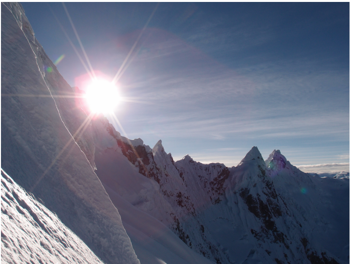
The view from the upper part of the south face.