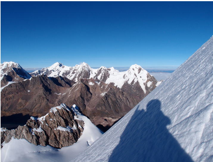
Looking west from the upper south face of Nevado Colque Cruz.