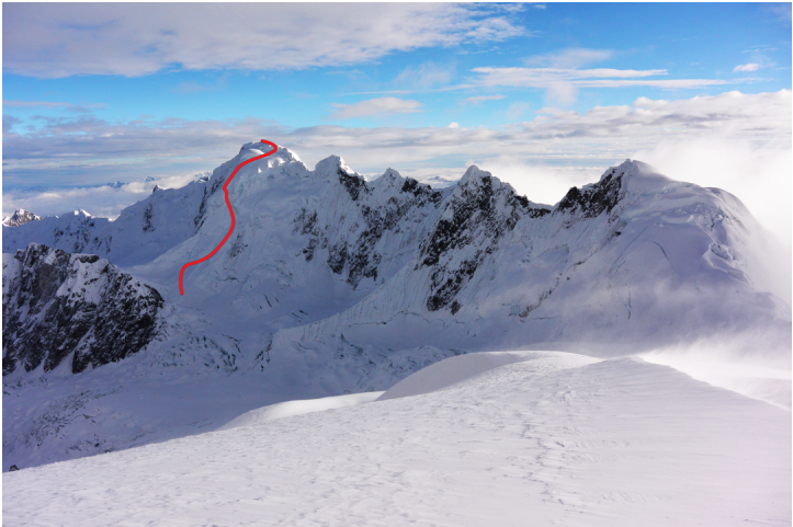
Nevado Colque Cruz, as seen from Nevado Chumpe, showing the line of ascent on the south face (500m, D).