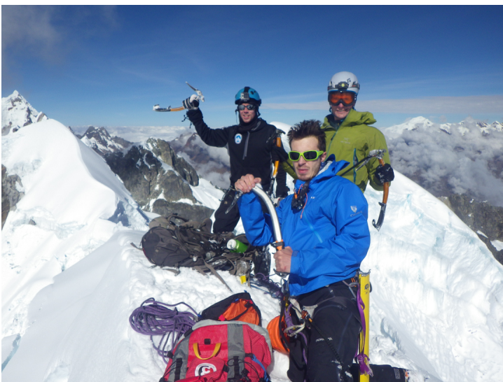
Atop the north summit of Nevados Humantay.