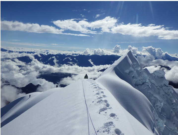
Coming up the summit ridge of Nevados Humantay.