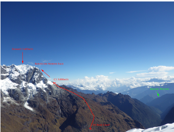
An overview of the route to the north summit of Nevados Humantay.