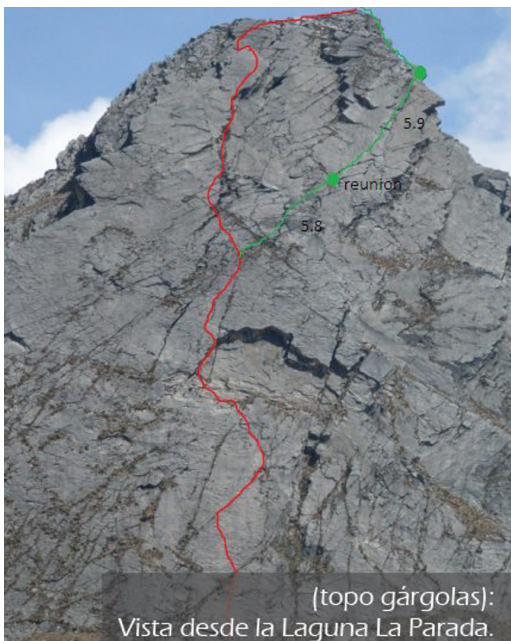
Campanillas Negro (4,875m), showing Gárgolas (5.10d, Cárdenas-Pardo, 2011) up the red line and the new variation El Mojón (5.10d, Arguello-Cardozo-Rubio, 2015) up the green line.