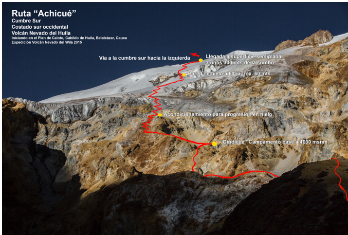
The south summit (5,085m) of Volcán Nevado del Huila (5,364m), showing the new route Achicué (AD 60°) on the southeast side of the mountain.