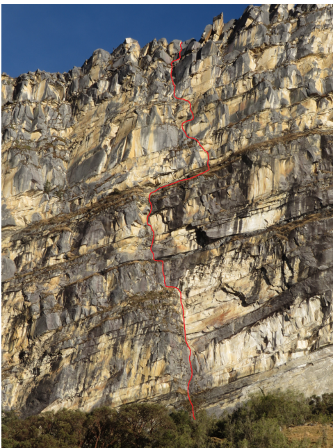
A close-up view of the new route Matto Tracción (250m, 5.10c) on the Cardenillo Wall (4,680m).