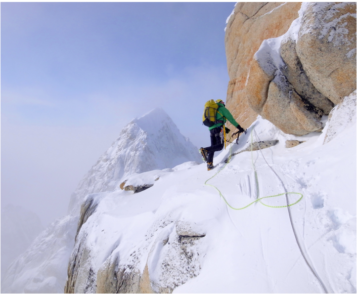
Nearing the summit of the Citadel.