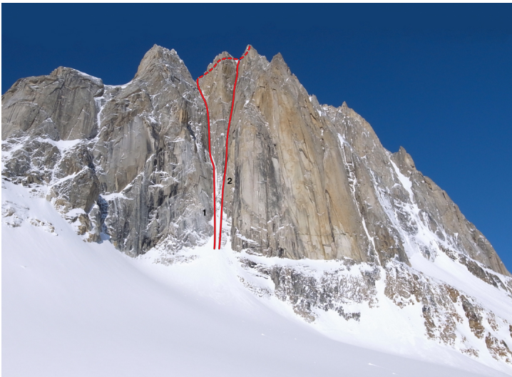
East face of the Citadel, showing (1) Hypa Zypa Couloir and (2) Supa Dupa Couloir. The north ridge comprises the right skyline.