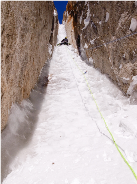
The crux ice lead.