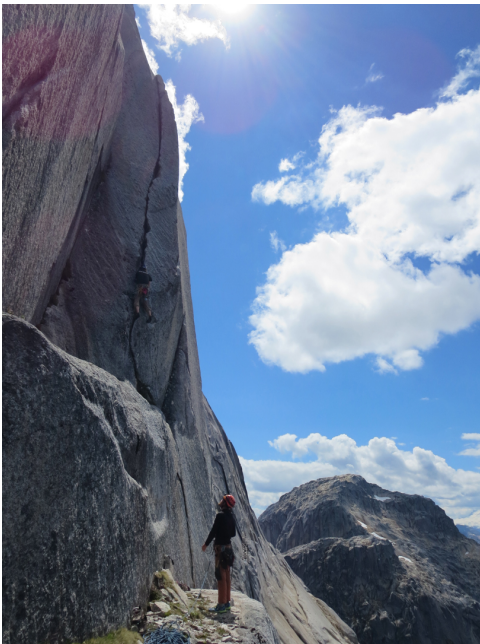
Cooper Varney heading up pitch 20.