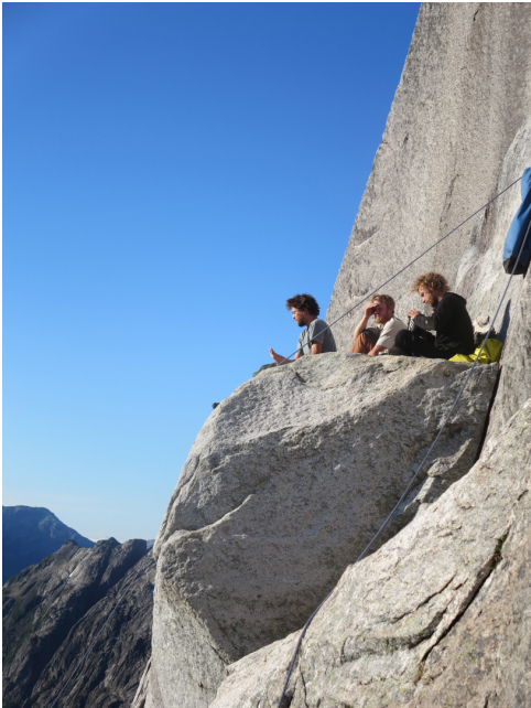
At the Hotel Juniper Bivy atop pitch 19.