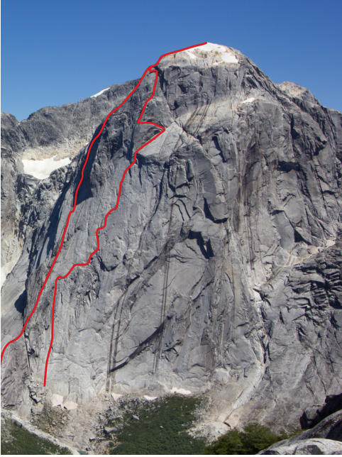
El Monstruo showing La Presencia de Mi Padre (left) and Aprendiz del Monstruo (right).