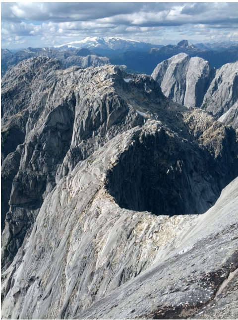
The descent ridgeline.