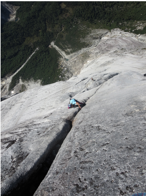
Cooper Varney leading the 5.12 crux on pitch 18.