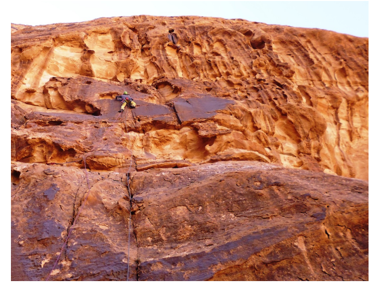
Steffen Krug on the third pitch of Sound of Silence.