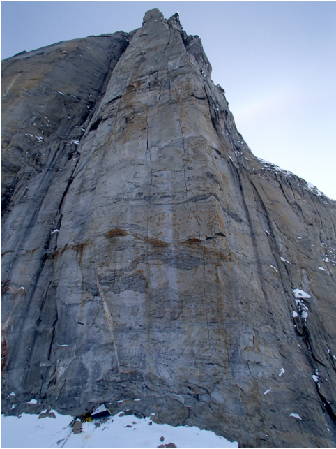
The upper headwall, what the team dubbed the Arena.