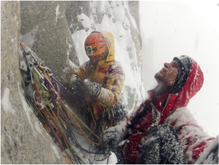
Racking up in a storm on Pitch 27.