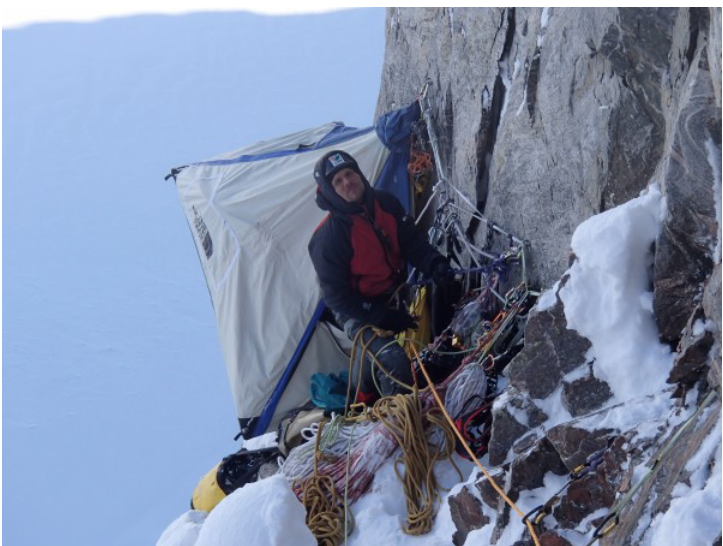
The duo climbed in extremely cold conditions.