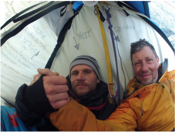
Resting in the portaledge.