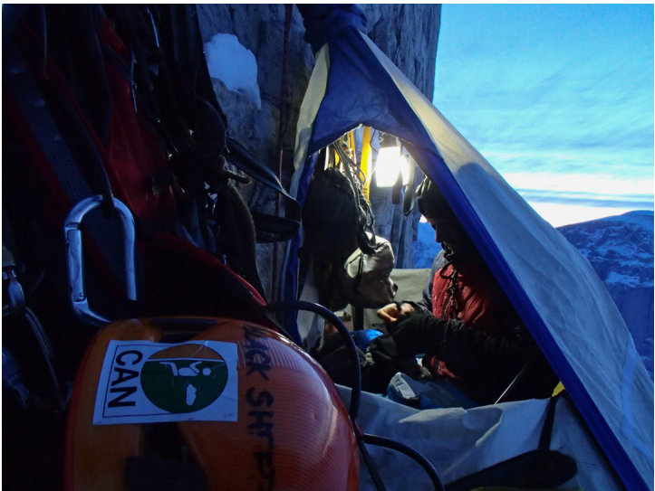
Camp on the upper headwall.