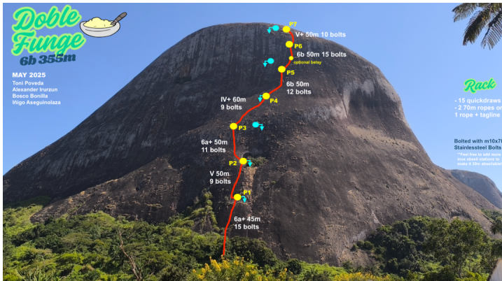
Photo-topo of Doble Funge on the east face of Cunduvile at Cumbira Segundo.