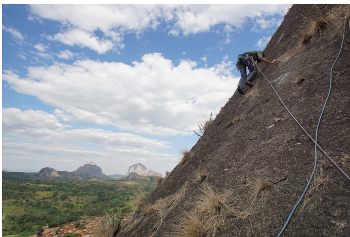
Climbing on Doble Funge on the east face of Cunduvile at Cumbira Segundo.