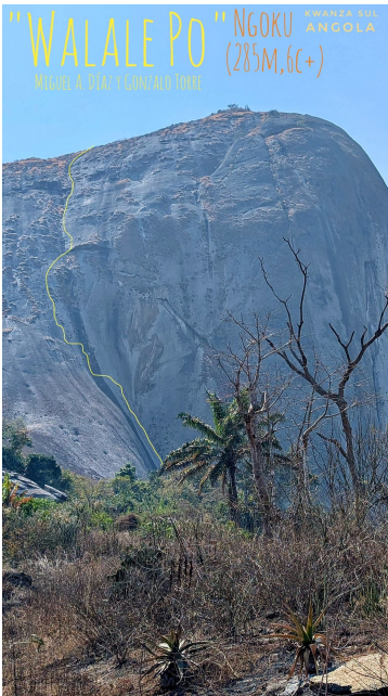
The new route Walale Po (285m, 6c+) on Ngoku dome.