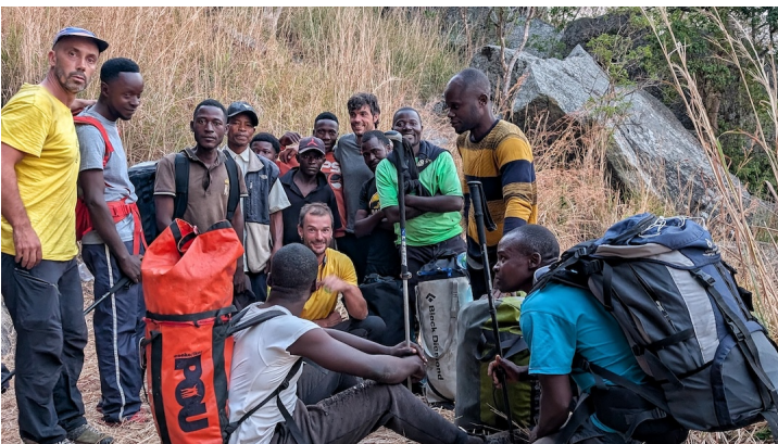
The 2025 Spanish team at the base of Kaikiawila dome with some of the local residents that helped