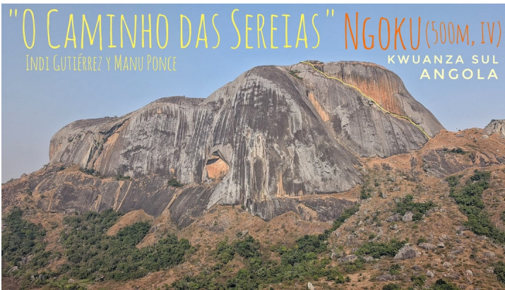
The new route O Caminho das Sereias (500m, 4a) on Ngoku dome.