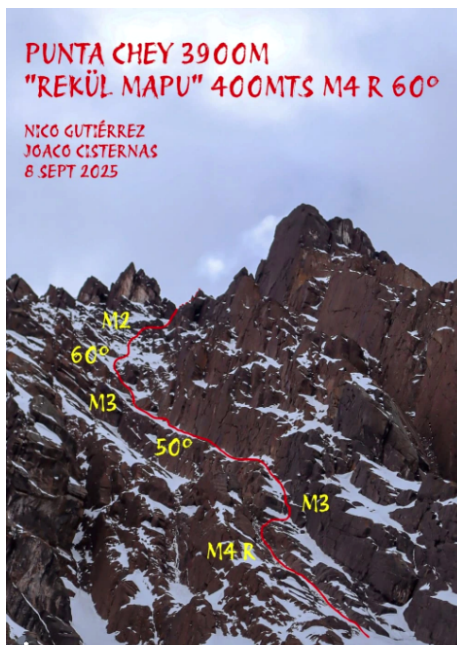
Rekül Mapu on Punta Chey.