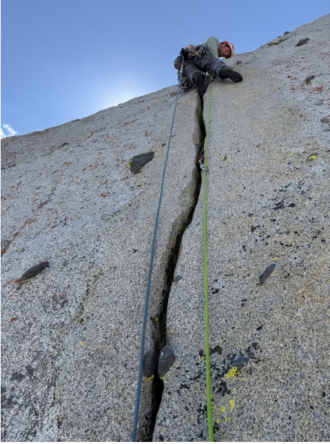
Derek Field swims up the 5.10a splitter (5.10a) on pitch three of Giselle's Big Advencha.