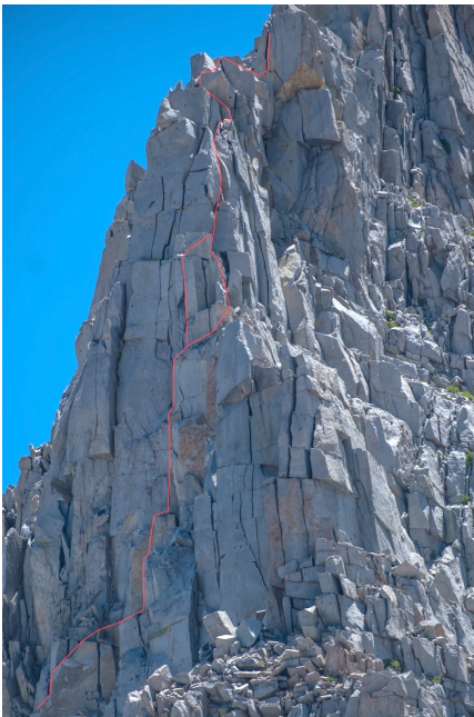
Close-up of the upper section of Giselle's Big Advencha (1,200', 5.10+) on the north pillar of Mt. Crocker.