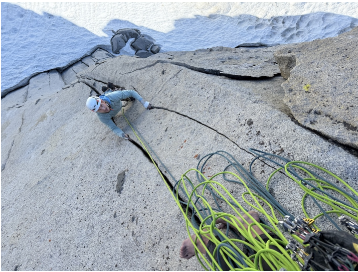
Derek Field following the second pitch (5.10) on Giselle's Big Advencha.