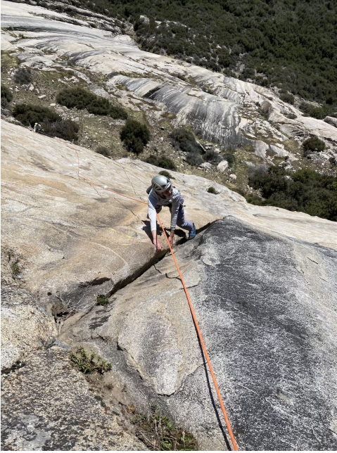
Tristan Thau following pitch six (5.11b) on Tying the Knot.