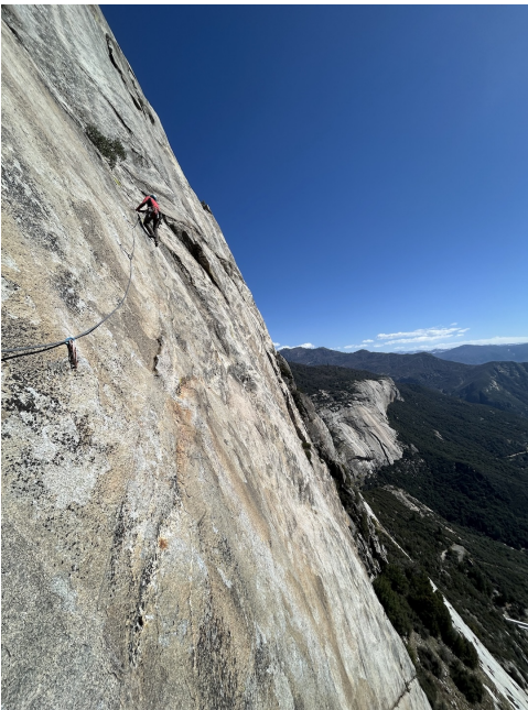
Daniel Jeffcoach casting off on pitch seven of (5.9) Tying the Knot (9 pitches, 5.12d).