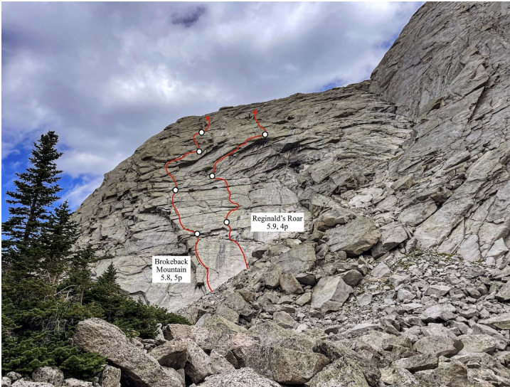
The lines of Brokeback Mountain and Reginald's Roar on the west face of Sumac Point.