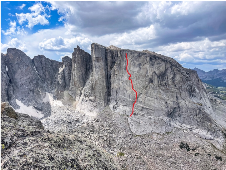
Sunset Wall with the line of Holding Out for a Hero (1,000', 5.12- C1) as of the end of 2025. The prow at the left end of the wall is Cowcatcher, with Wombat Spire just to its left.