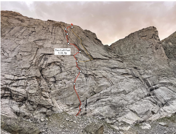
The line of Two Left Feet on Sumac Point. The 1,100-foot route shares the first few pitches with Chicken Talk, established in 2020 (yellow dashed line), then continues independently for five pitches, then finishes with the last pitch of Chicken Talk.