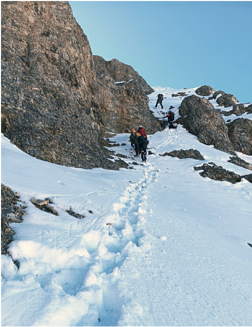
Near the top of the northwest face of Monto II, a little before reaching the crest of the southwest ridge.