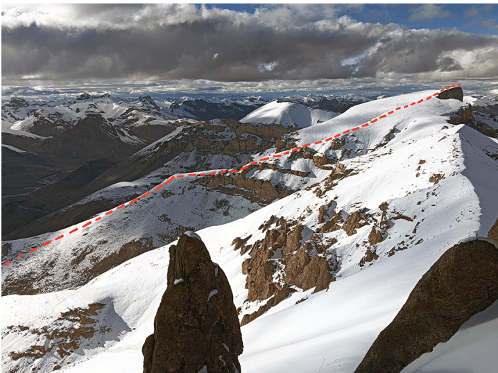
Monto IV and route of first ascent via the southwest spur.