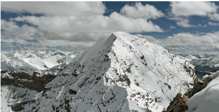
Unclimbed Monto I (6,331m) from the summit of Monto II.