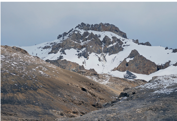
Monto III (ca 6,250m GPS) from the west. The ascent followed the right skyline to the headwall then made a long traverse right to gain the south ridge, which was followed back left to the summit. A large cairn on top indicated a previous ascent by an unknown route.