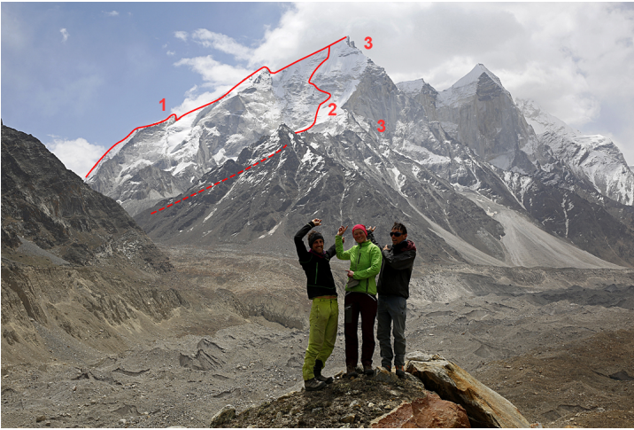
Bhagirathi II from the northwest with Bhagirathi III on the right. (1) Northeast ridge (2022), (2) North-northwest face (1,700m, 35 pitches, Maguire-Rea-Stelfox, 1981; Maguire was killed on the descent). (3) West face to west ridge (Raveschietto-Sarchi, with initial help from Bonapace, 1984).