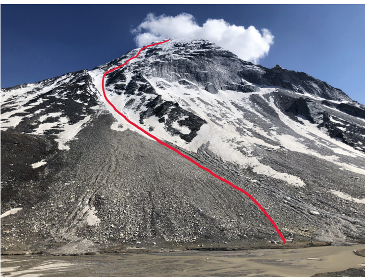
A foreshortened view of the triangular facet, which is around 1,000 meters in height, on the lower