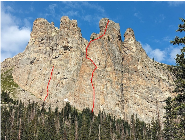
tower topos tower 2 and 4 The Ptarmigan Towers, with Pika Kombat on Tower 4 (left) and Unoriginal Sin on Tower 2 (right). Other routes are not shown.