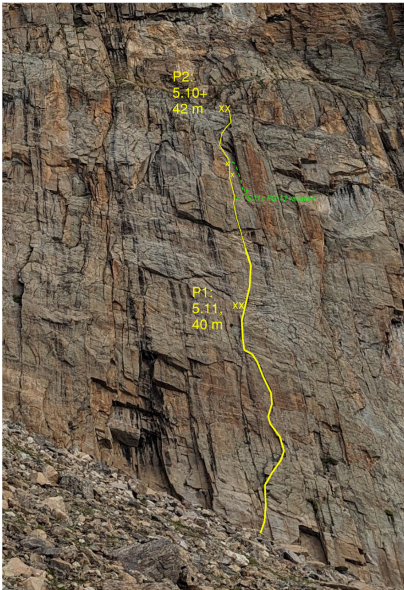
Photo-topo of Pika Kombat on Tower 4 of the Ptarmigan Towers.