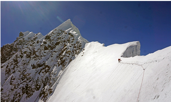
Close to the farthest point reached on the 2025 attempt on Munoch Chhok. The main summit is on the left.