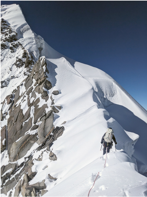
Climbing along the northeast ridge of Munoch Chhok.