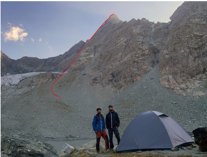
Inayat Ullah Bhat and Laway Mudasir at base camp by Novsar Lake with the approximate line of their route on Cathedral Dome (Brahma Satli Central).