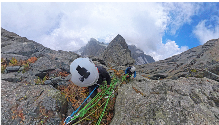
At the top of the second pitch above the col on the southeast ridge of Cathedral Dome.