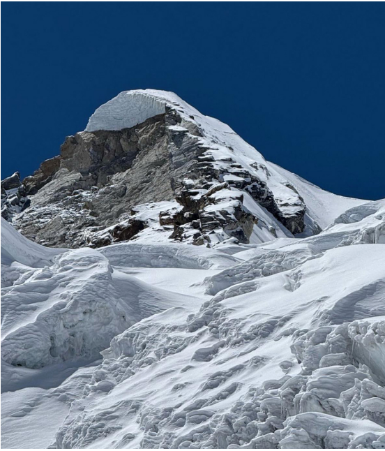
The summit of Sharphu VI from high on the east flank glacier. The top was reached via the final section of the northwest ridge (right skyline).