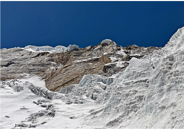
View of the summit area of Sharphu VI while ascending the complex glacier on the east flank.