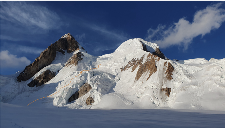
Seen from the southwest, Biarchedi I (6,810m, left), Biarchedi IV (6,690m), and the route attempted to the ca 6,400-meter col between the two.