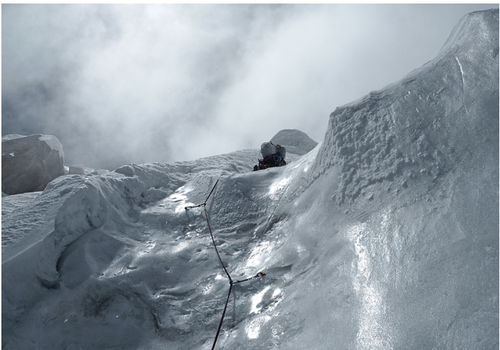
Climbing hard, textured ice on the final day to reach the top of the southeast face of Hunza Peak.