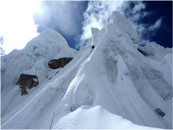
Around 100 meters directly below the top of the snow and ice tower on the summit ridge of Hunza Peak.