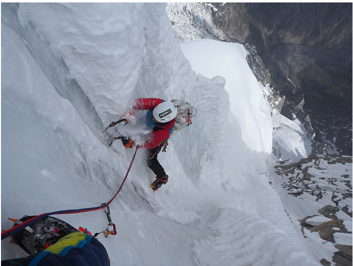
On the final day of the first ascent of the southeast face of Hunza Peak.