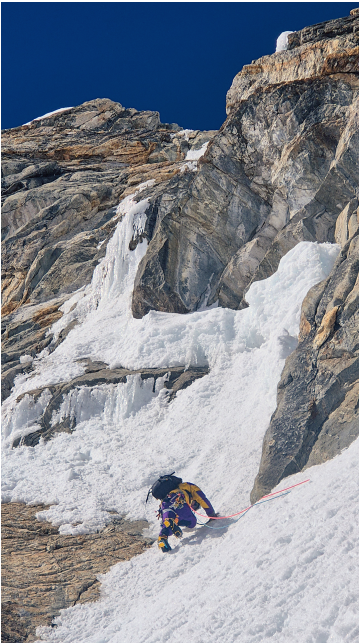
Hervé Barmasse heading toward the final ice and mixed pitches on the southeast face of Numbur.