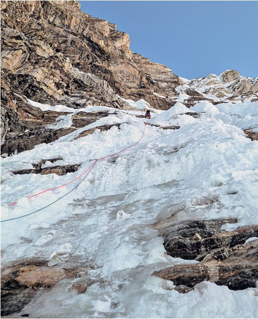
The initial pitches of the southeast face of Numbur.

A panoramic view spanning north to east from the summit of Numbur. (A) Lunag. (B) Nangpai Gosum. (C) Cho Oyu. (D) Gyachung Kang. (E) Hungchi. (F) Pumori. (G) Everest. (H) Lhotse. (I) Makalu. (J) Chamlang (K) Kangchenjunga. (L) Tengkangpoche. (M) Kwangde Nup. (N) Kwangde Lho. (O) Kwangde Shar. (P) Ama Dablam. (Q) Nupla West (Peak 5,816m). (R) Khatang. (S) Kusum Kanguru.