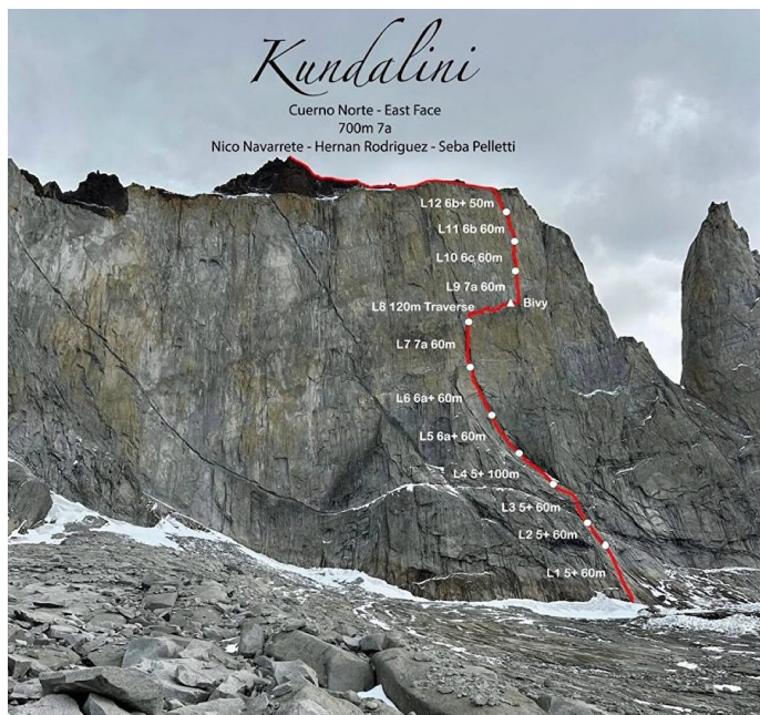
The line of Kundalini on the east face of Cuerno Norte.