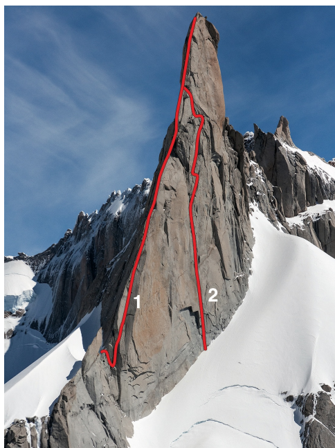
Aguja Pollone with (1) La Granja (6c, 1997) and (2) Joviejo (350m, 7a). The former, with its direct start (shown), is said to be one of the great rock climbs of the range. The latter was established in 1998 and was free climbed in early 2025.