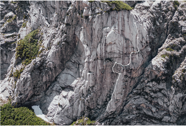
Line of the incomplete route Soft Hammer (9 pitches, 5.11d A1 to high point) below Cerro Tres Negros.