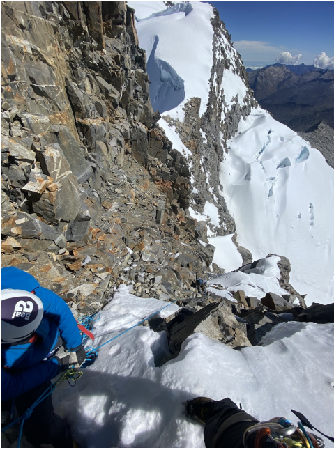
Looking down the second pitch of AYU on the south side of Picoón Bolívar.