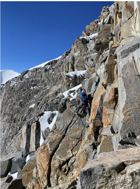
Ricardo Rubio moving through the third mixed pitch on the south face of Pico Simón Bolívar.