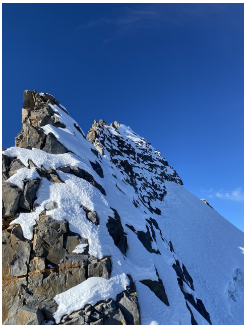
The upper east ridge of Pico Simón Bolívar.