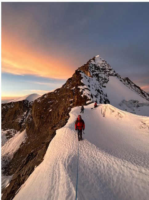
On the upper slopes of Pico Cristóbal Colón, looking west at Pico Simón Bolívar.