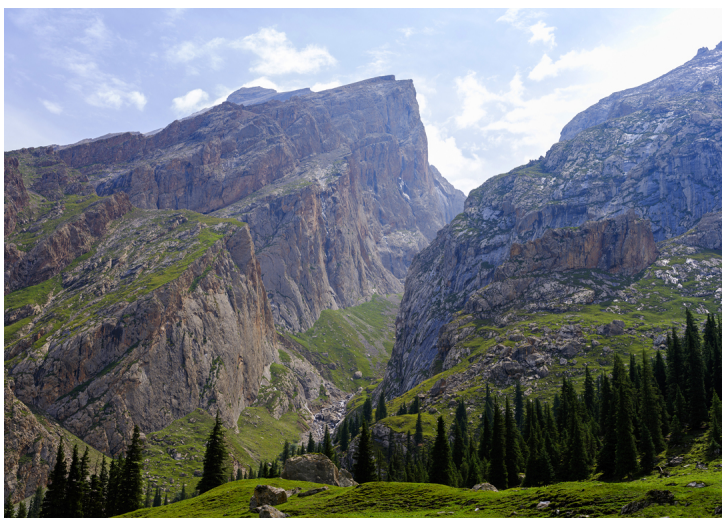
Unclimbed rock walls by Paradise Lake, Xinjiang. The rock is limestone, generally of high quality at