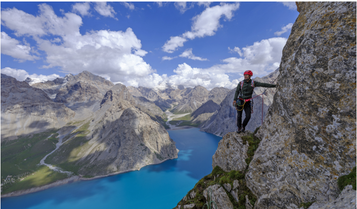
On Dry Martini, with the eastern arm of Paradise Lake and unnamed peaks behind.