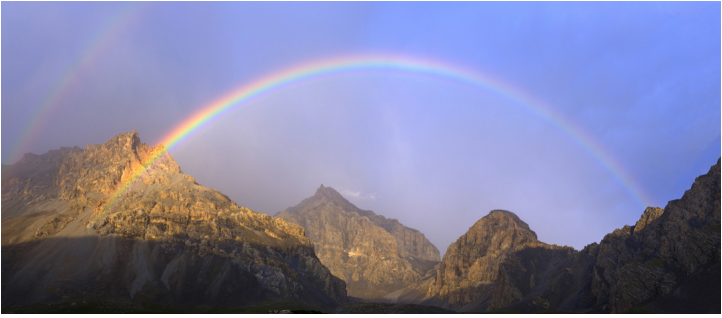
Unclimbed rock close to Paradise Lake, Xinjiang.