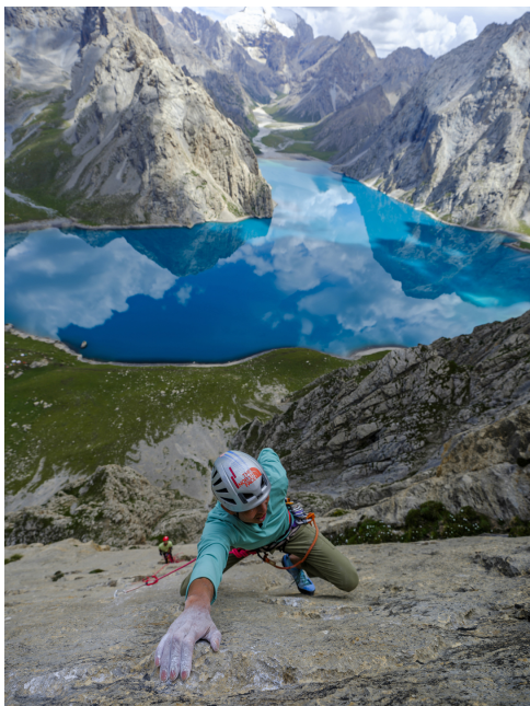
On the first ascent of Dry Martini, looking east across Paradise Lake toward unclimbed rock.