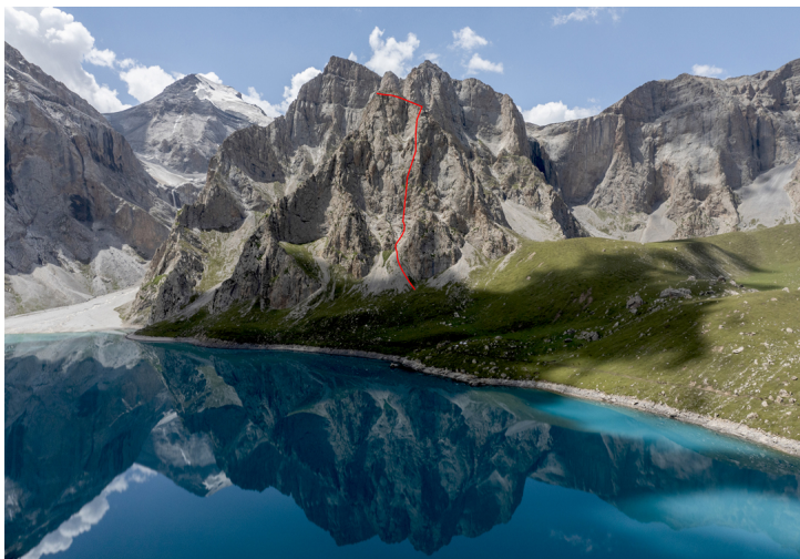
Dry Martini (11 pitches, 5.11a) above Paradise Lake.