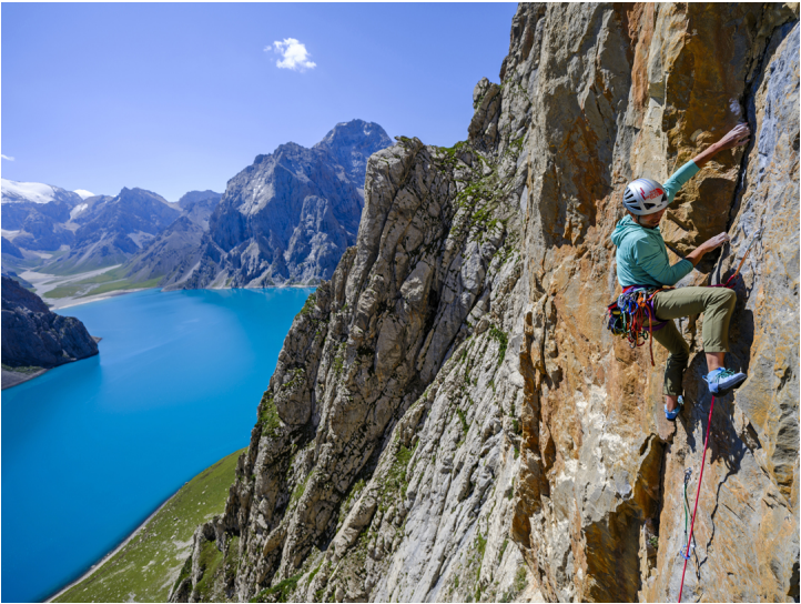
During the first ascent of Dry Martini above Paradise Lake, Xinjiang.