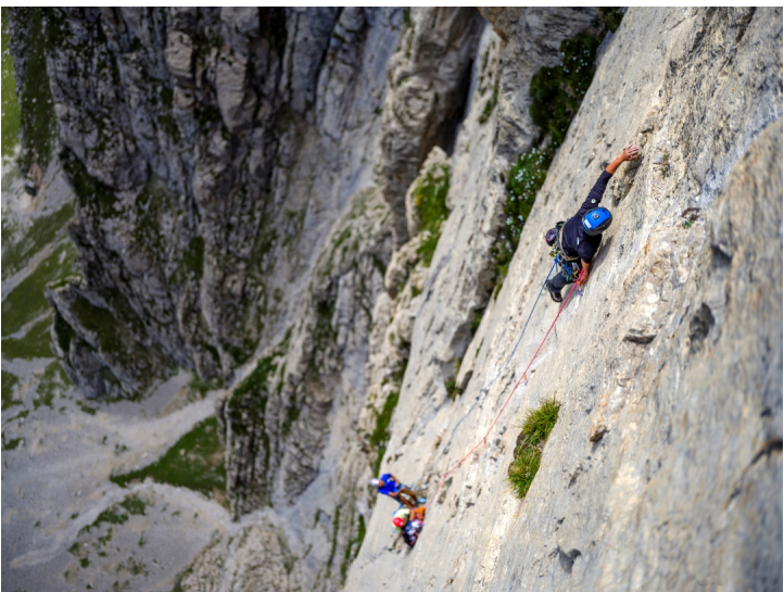
During the first ascent of Dry Martini above Paradise Lake, Xinjiang.