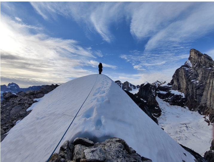
Daniele Bonzi on the snowy ridge of Molar Spire during the second day of the Trident VI Orobica (1,000m of climbing, V+) traverse, Fox Jaw Cirque, Schweizerland, East Greenland.