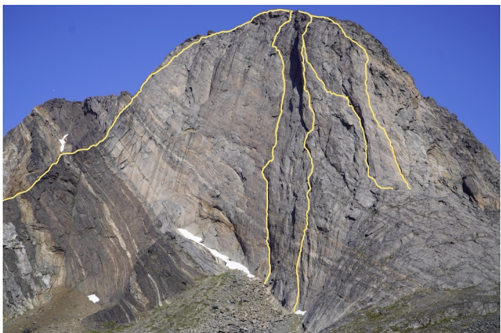
From left to right, the new climbs on the west face of Innaarsuit, measured in climbing distance, are: Encore (332m, E4 6a), Twist of Fate (417m, E5 6a), Gas Mark Five (404m, E5 6b), Uliaq (290m, E3 5c), and Lowesater Gold (246, E4 6a).