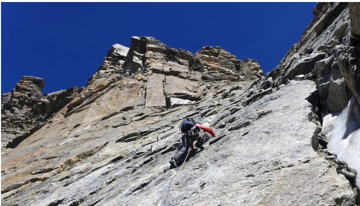
Tess Smith on the south ridge of Starikatchan during the 2022 attempt, when the climbers got within about 100 meters of the summit.