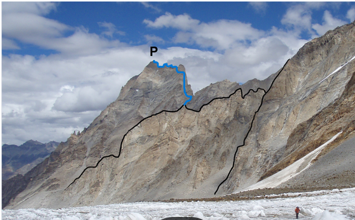
Looking down the Shimling Tokpo at Starikatchan and the upper part of the 2024 first-ascent route on the south ridge. The ridge was approached by the west face, beyond the foreground ridge marked by a black line.