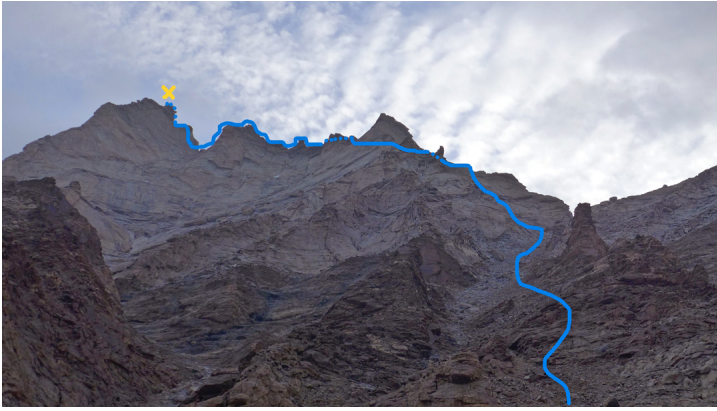
Route of first ascent of Starikatchan (5,904m) via the west face and south ridge.