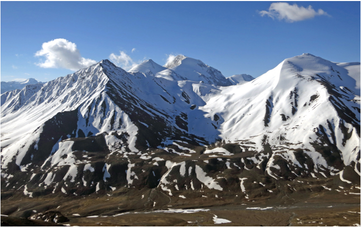
Hemar Ri (right) seen in snowy conditions from partway up Nigutse South in 2015. On the left is a peak of around 5,600m, close to the road that leads to the Sirsir La. In the center background is Machu Kangri (6,086m).